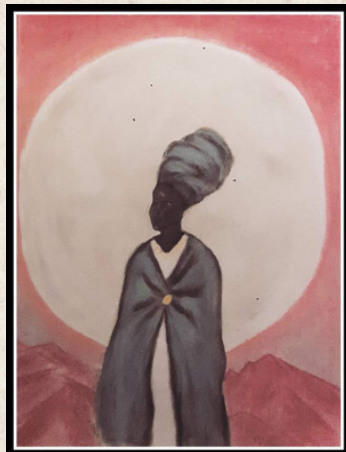
From the Mountains of the Moon (2019)