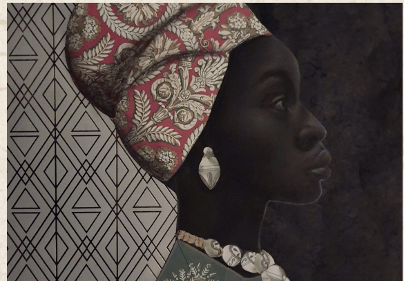
Sopdet, The Transdimensional Social (2019)