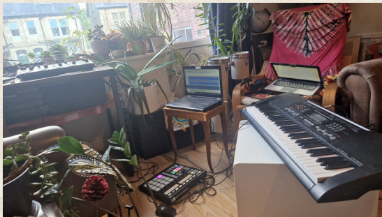
Tuesday Sessions building rhythms and sounds at the Maryfield Studio

future. And science is a philosophy full of imagination and unanswered questions - just like art, so now I want to create from where the two meet . Past, future, time exploration -It's all about the illusion of time ." She explains, "and the emerging collection will be a superposition of science, history, art, literature, music and film, creating a multi-sensory story. "