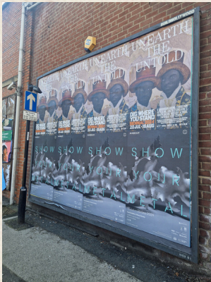
Black Romulus and Remus on billboards in Sheffield City Center

house Estates was no exception. “Finding the story of a Black Romulus and Remus was such a monumental marking on my timeline. The roman Romulus and Remus is a tale that’s well known and well taught, Now is the time for Black Romulus and Remus, and I had the honour of telling that story.”