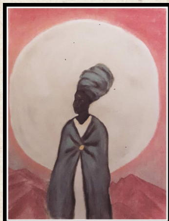
From the Mountains of the Moon (2019)