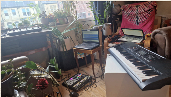
Tuesday Sessions building rhythms and sounds at the Maryfield Studio

future. And science is a philosophy full of imagination and unanswered questions - just like art, so now I want to create from where the two meet . Past, future, time exploration -It's all about the illusion of time .” She explains, “and the emerging collection will be a superposition of science, history, art, literature, music and film, creating a multi-sensory story. ”