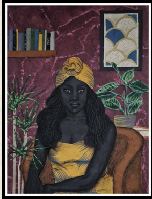
Her Healing Space (2023).

This article is linked to a soundtrack. Click to listen