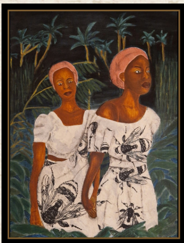
Searching for Addis (2024).