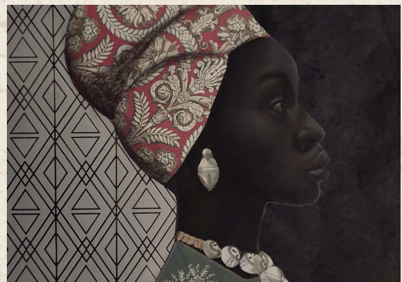
Sopdet, The Transdimensional Social (2019)